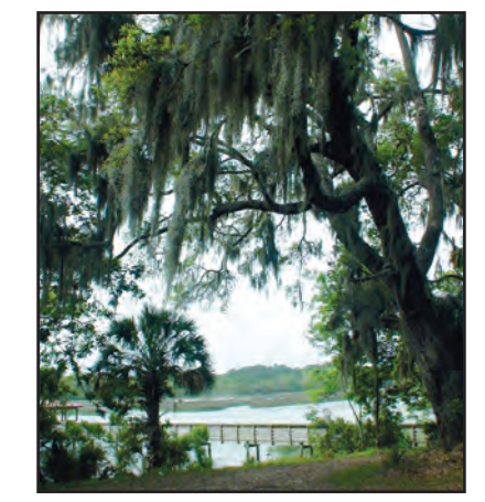
View from MLK retreat cabin

SC PROGRESSIVE NETWORK POB 8325, 2025 Marion St., Columbia SC 29202 803.808.3384 • network@scpronet.com • www.scpronet.com • Find us on Facebook and Twitter