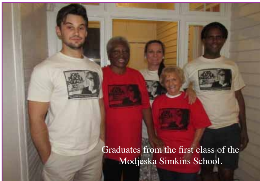
Graduates from the first class of the Modjeska Simkins School.

The Modjeska Simkins School for Human Rights was launched in 2015 to train a new generation of leaders by teaching them skills to build healthy communities and promote sound public policy in South Carolina.