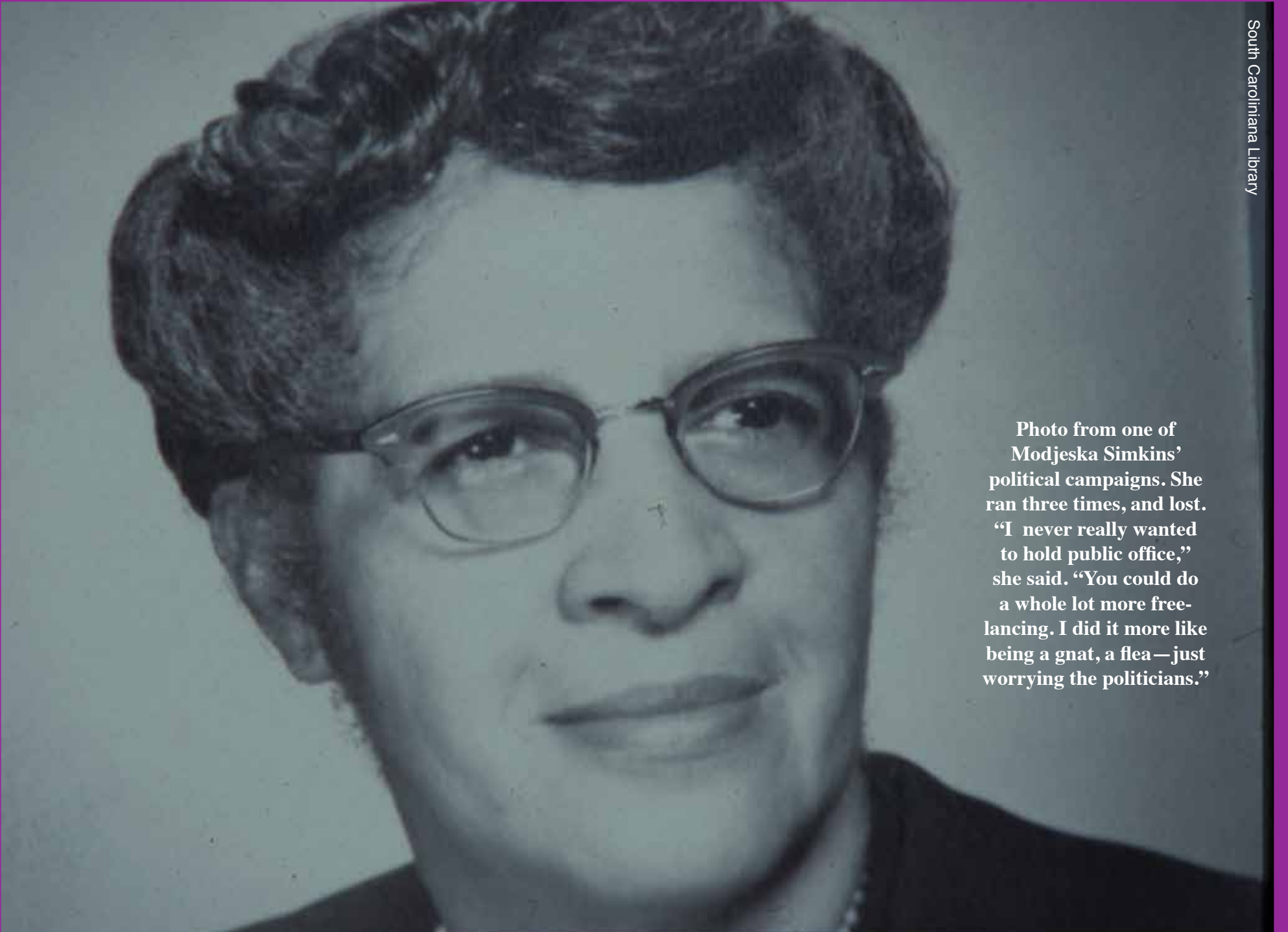
Photo from one of Modjeska Simkins' political campaigns. She ran three times, and lost. "I never really wanted to hold public office," she said. "You could do a whole lot more free-lancing. I did it more like being a gnat, a flea—just worrying the politicians."