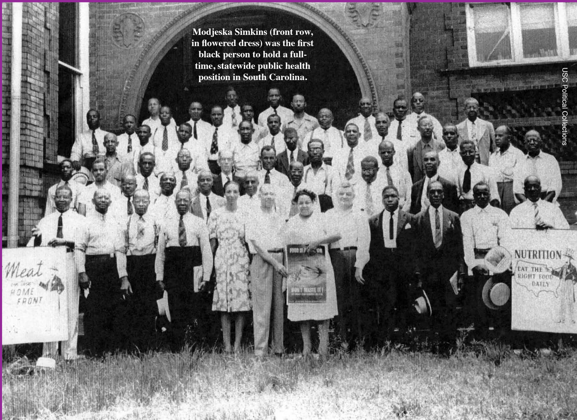
Modjeska Simkins (front row, in flowered dress) was the first black person to hold a full-time, statewide public health position in South Carolina.