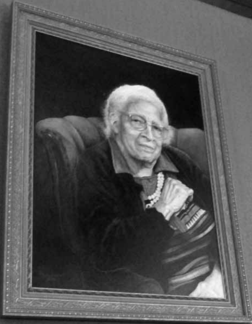
This portrait of Modjeska Monteith Simkins hangs in the SC State House. Although it was installed in 1995, it still lacks an identifying plaque.